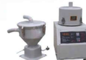
全自动上料机 Vacuum Autoloader