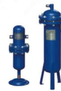
空气过滤器 Air Filter