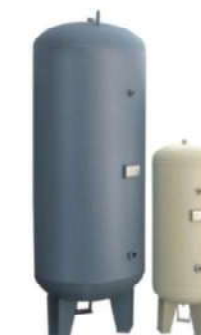
储气罐 Air Tank