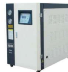
冷水机 Water Chiller