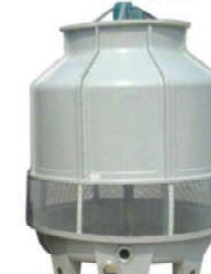
冷却塔 Water Cooling Tower