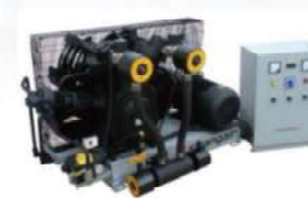
空压机 Air Compressor