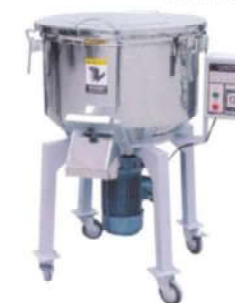
混色机 Color Mixture