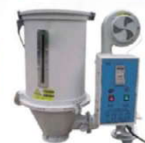
干燥机 Plastic Dryer