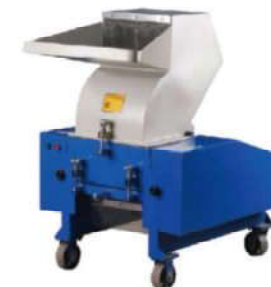
强力重力破碎机 Strong grinder